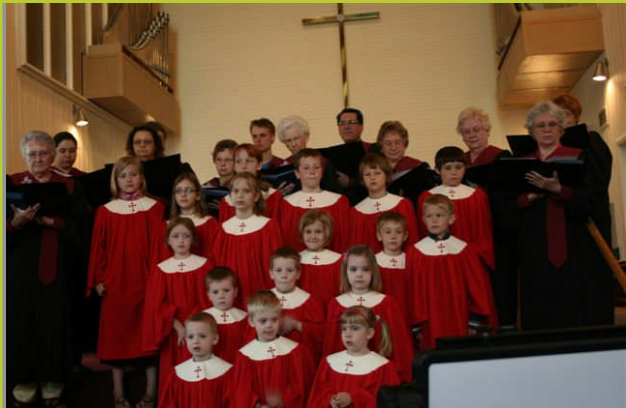
The Children's Choir Singing "Through the Window" with the Chancel Choir on Mother's Day.