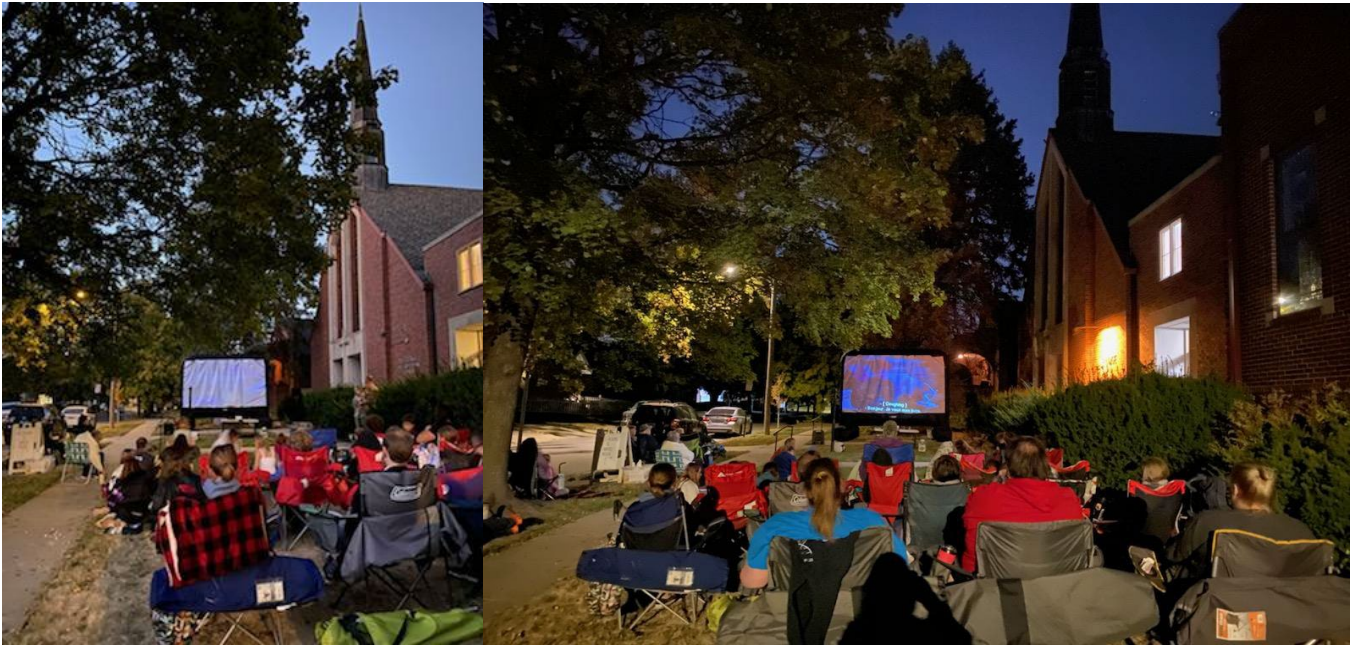
Movie night - October 21, 2022