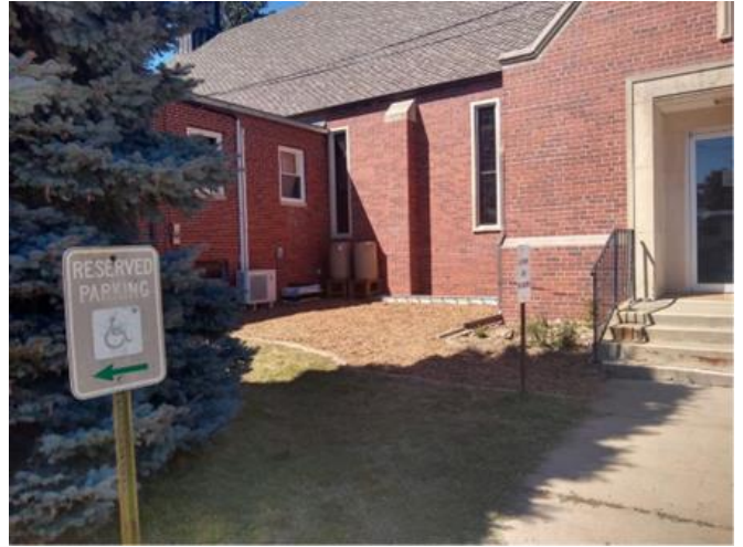
Before & after photos from Ben's Eagle Scout project