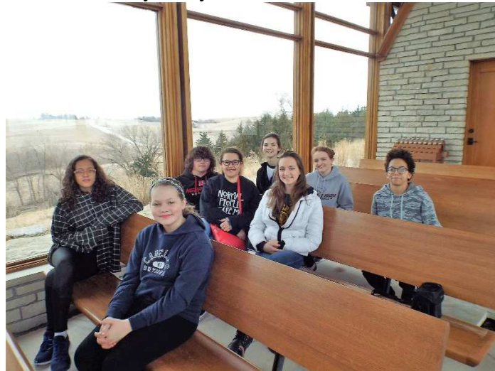
DUCs visiting the Holy Family Shrine during 2017 Retreat “The Mountaintop Experience.”

March 11 th -12 th the DUCs participated in an overnight retreat at Camp Ashland where a great time was had by everyone in attendance.